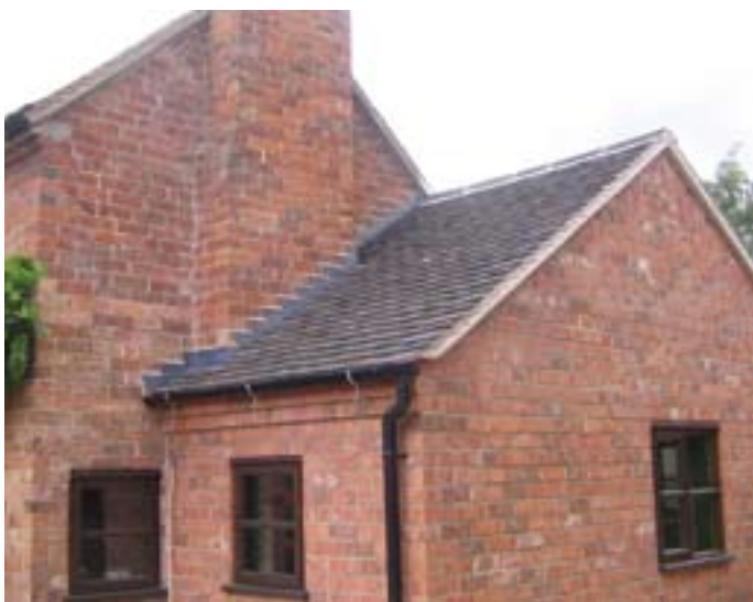
Example of extension to period property using 73mm Cotswold Blend

By using our traditional kilns, we have created a charming range of beautiful and natural colours of warm and pastel shades for use in individual new builds and renovation projects.