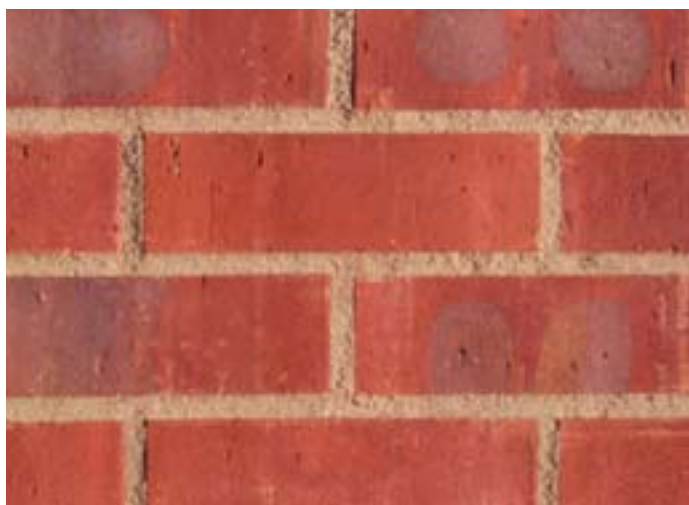
Donnington Deep Red