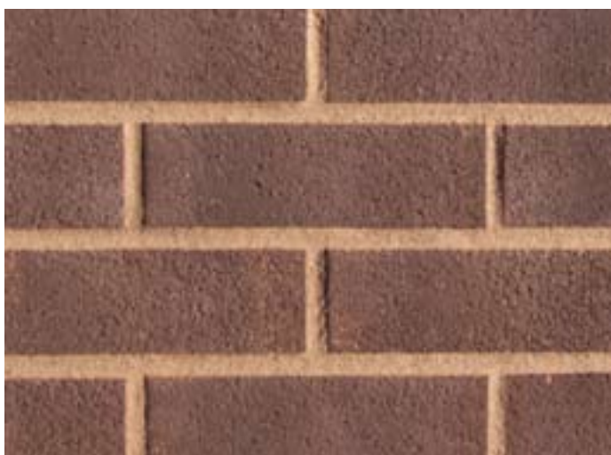
Northwick Dark Brown

48 hour sample board despatch available on request