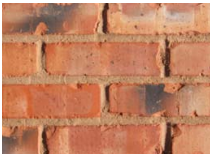
Cherwell Urban Antique