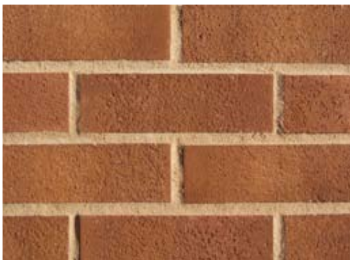
Northwick Autumn Brown