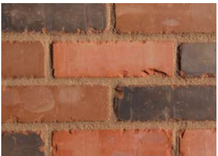
Cherwell Terrace Blend

65mm Metric and 73mm Imperial sizes available ex stock