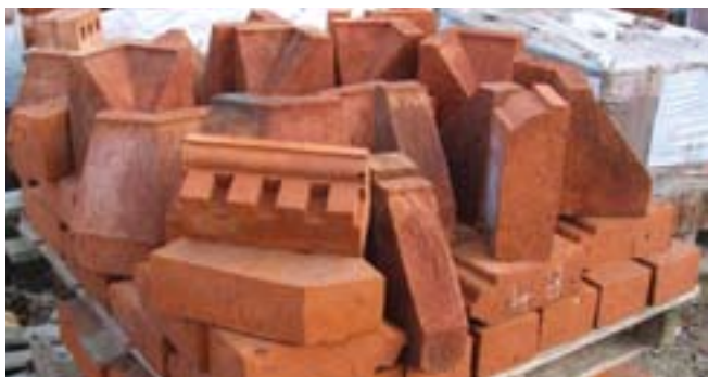
An interesting and varied selection of shape, size and colour

Besides a large variety of wire-cut facing bricks, bench-moulded handmade bricks and a selection of reclaim bricks, Northcot offers a wide range of Specials. Northcot takes pride in its specialist ability to match bricks from many parts of the country for renovations.