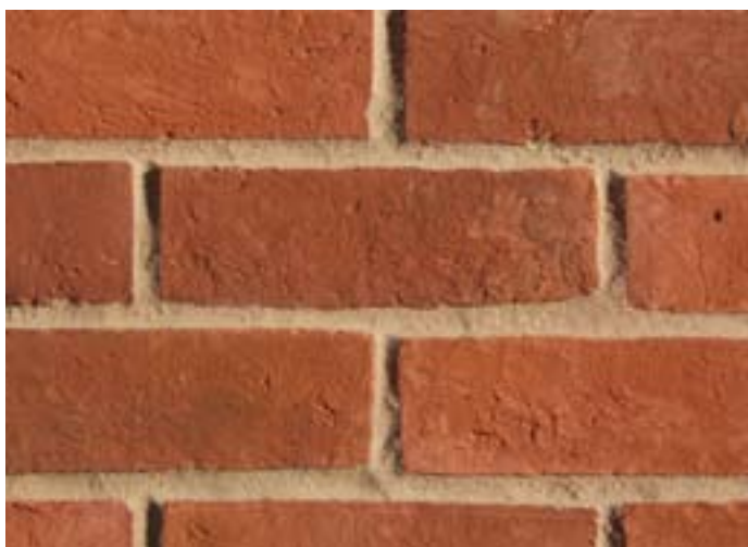
Lyneham Red Antique