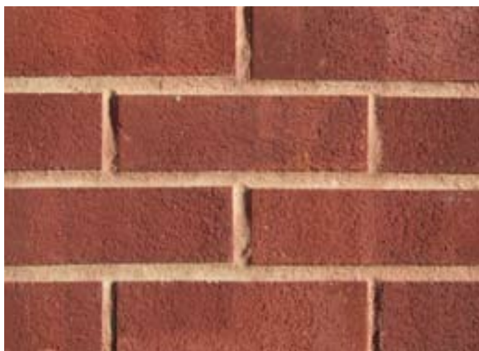
Northwick Red Sandfaced