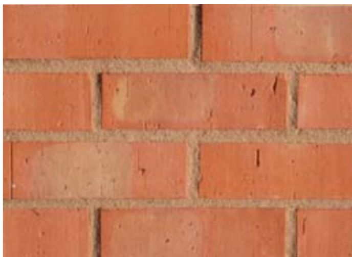
Light Red Rustic