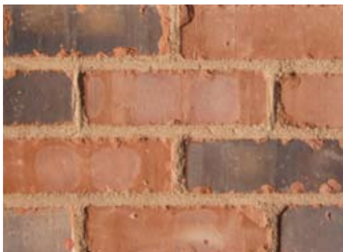
Cherwell Autumn Blend