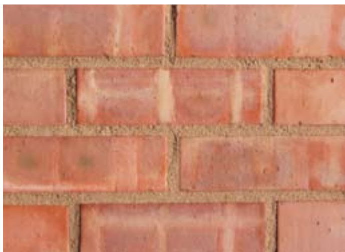
Victorian Greenwich Blend