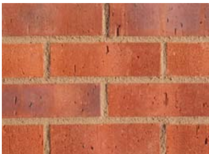
Multi Red Rustic